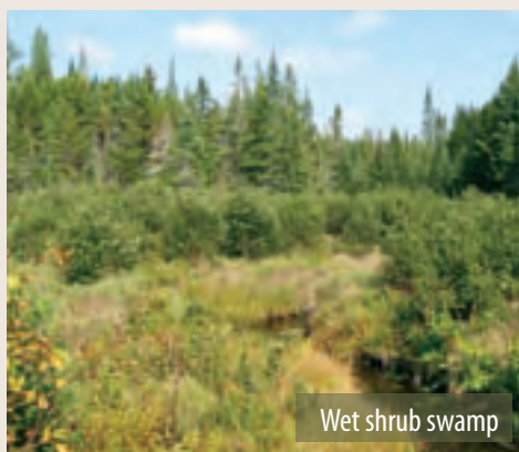
Wet shrub swamp

Shrublands exist in patches throughout the state, but most are difficult to recognize on traditional satellite imagery, so their total expanse in the state is unknown. Communities that map the location of shrublands as part of a natural resource inventory are encouraged to send their data to New Hampshire Fish & Game to contribute to statewide habitat data.