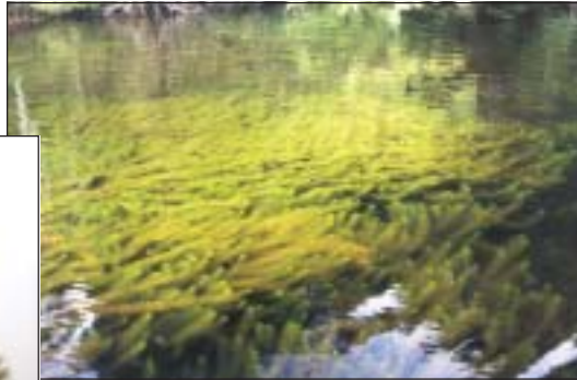
Many invasive water plants, like variable milfoil (above), can grow up to an inch per day in summer heat, light, and nutrient conditions.