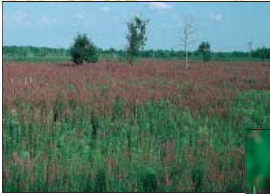
RANDY WESTBROOKS, U.S. GEOLOGICAL SURVEY

The Weed Watchers pay special attention to boat launch areas, which present likely ports of entry and good habitat for invasive plants because of high use; and areas with more organic lake bottoms, which offer higher nutrient levels and the opportunity for the plants to thrive. One of the invasive water plants they're hoping to not see is hydrilla — currently lurking near our borders in Massachusetts and Maine, just waiting to hitch a ride in. The volunteers are also alert to the appearance of unwanted aquatic animals, like zebra mussels, which can clog water intake pipes, foul