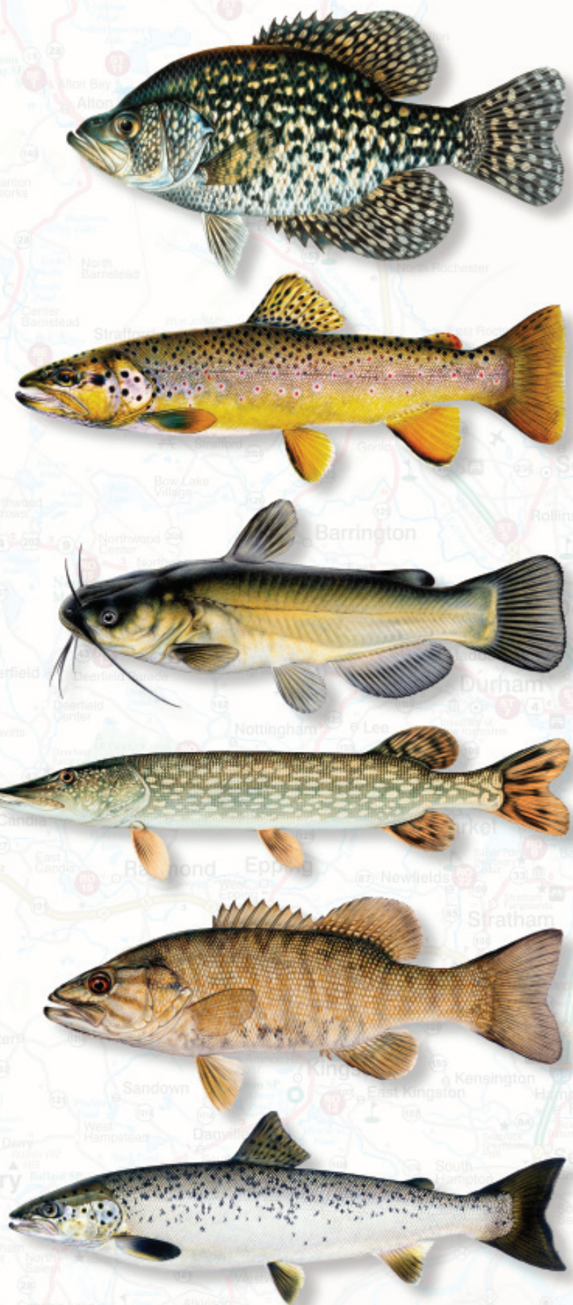
FISH ILLUSTRATION © JOSEPH TOWELLER

Fishing along Interstate 93 will yield an incredible variety of warm- and coldwater game fish. Top to bottom: black crappie; brown trout; brown bullhead; northern pike; smallmouth bass; Atlantic salmon...to name a few.